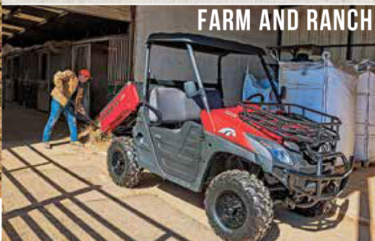
FARM AND RANCH