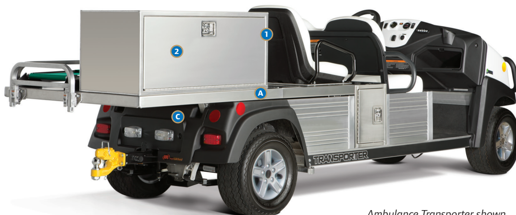
Ambulance Transporter shown here with optional receiver hitch and (front cover) strobe light bar.